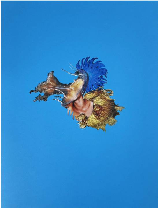
Yasmine Nasser Diaz